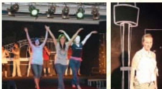
Photos taken of the models showing of their wears at the Fashion Parade.