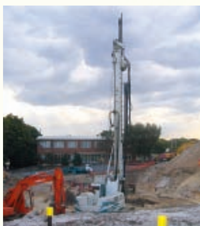
Firm foundations, the laying of the piles for the new building.

facilitate community, including 14 common rooms on its 7 floors, a rooftop terrace, a games room, a business centre, a convenience store, a reading room, two courtyards and a large ground floor common room. It will also have a strong team of academic tutors and pastoral care staff.