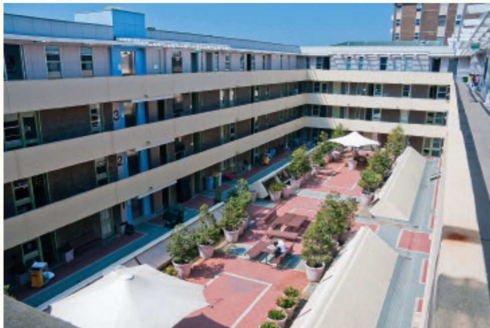
The Courtyard of New College as it was until November 2011.

New College first opened its doors to residents in 1969. Over its 42 years the building has seen a number of transformations, extensions and general upgrades to help serve the original vision. The addition of the Fourth Floor brought 37 new rooms, including 24 regular rooms, two Residential Advisor flats, six disabled access rooms, five ensuite rooms and two large meeting rooms. During the extensions of 2003–04, all of the