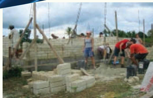
Busy building site as New Collegians erect a house for poor Filipinos

I've written quite a lot, yet to be honest, I'm struggling