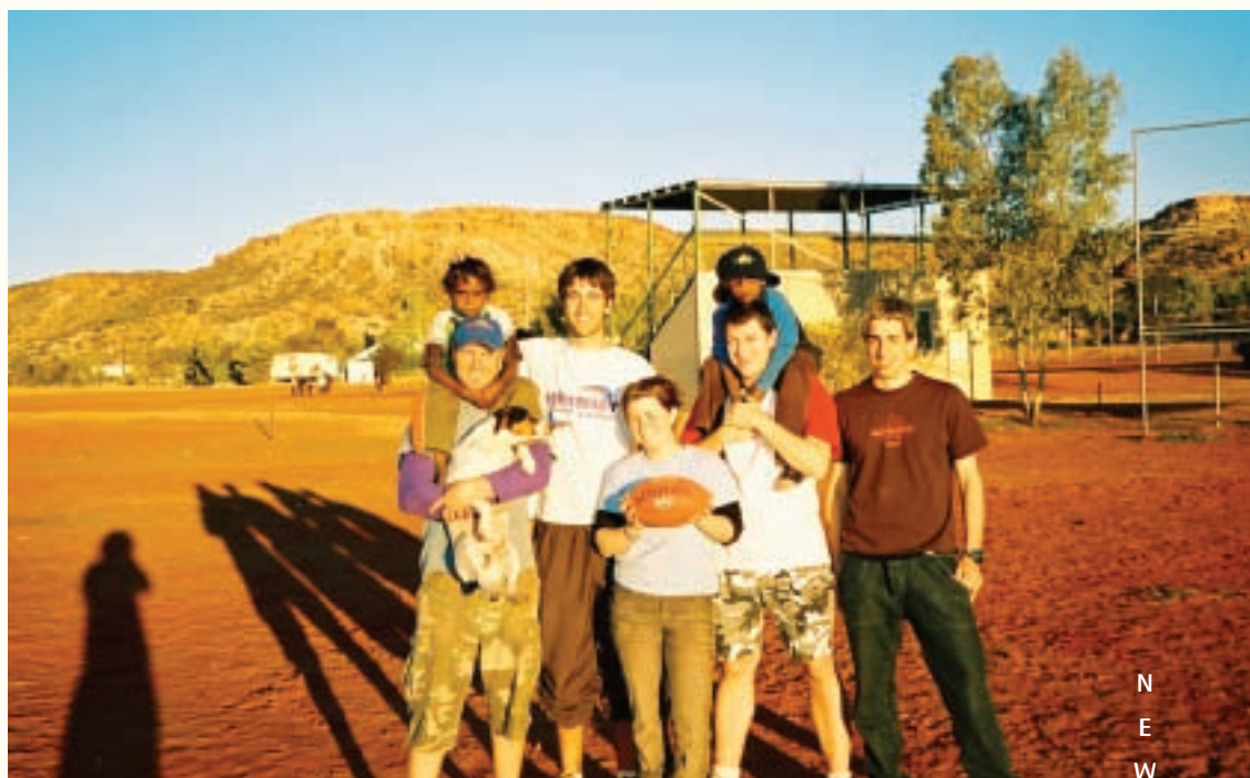
Some of the Outback Assist team with local aboriginal children.

The Women's Centre is a particularly inspiring place to be involved with; it is run independently of the council, and provides a refuge for the women of the