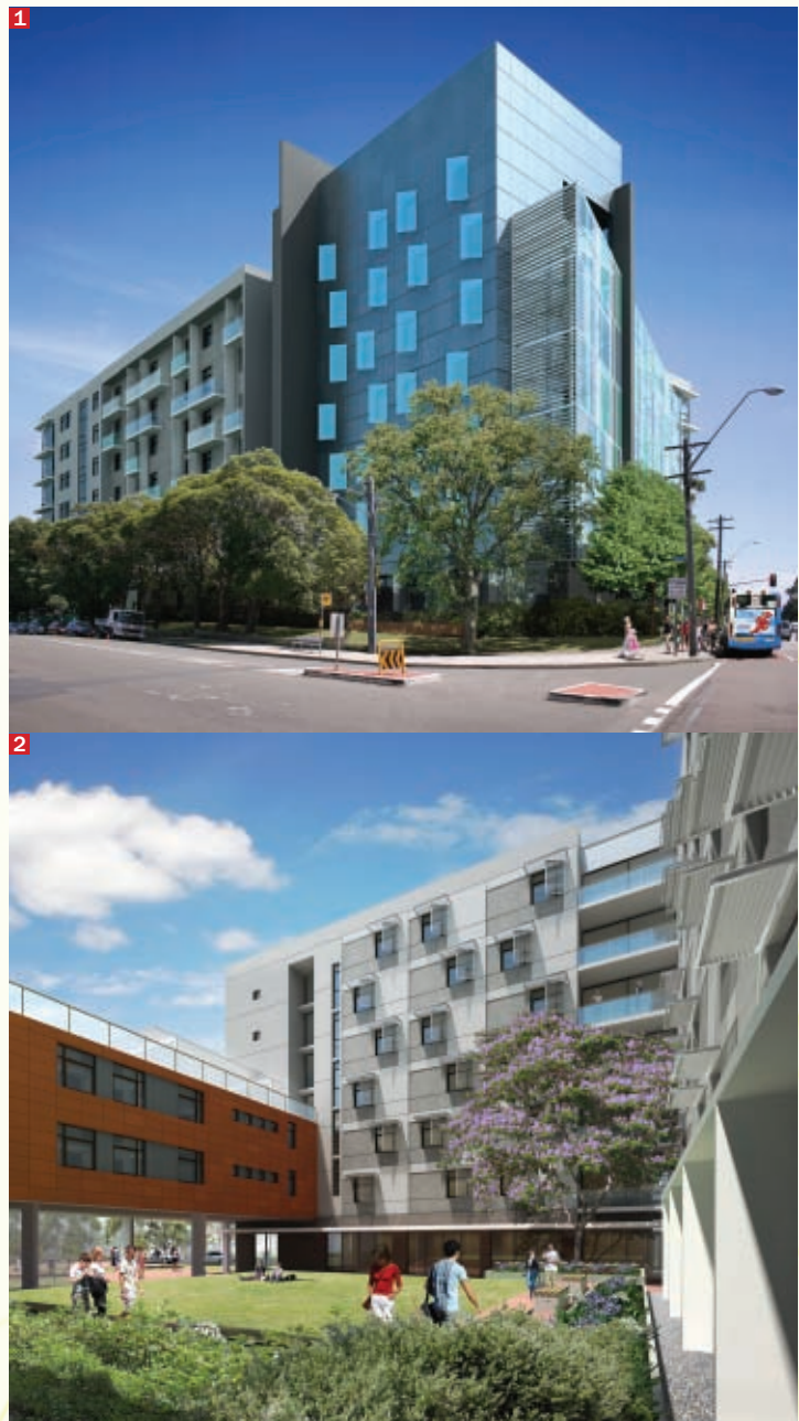
1: An architects drawing of the Postgraduate village, facing South on Anzac Parade 2: View of the inner courtyard

We still await approval ... subject to this being achieved; we will commence building the New College Postgraduate Village in August 2007 for opening in 2009.