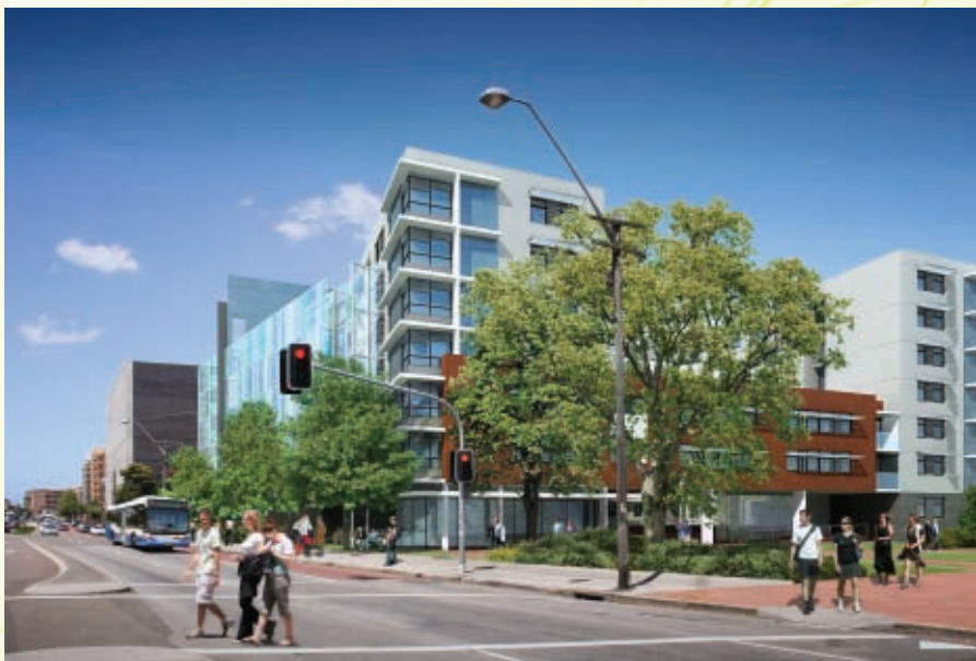
An architects drawing of the Postgraduate Village, facing North on Anzac Parade