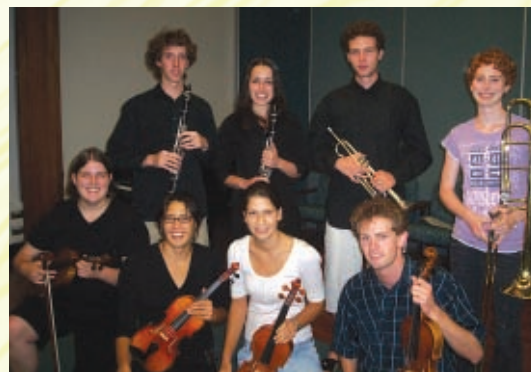
New College musical talent.

The affinity between New College and the Orchestra runs deep! While some players have stayed in the Orchestra for the entire eighteen years, the nature of the University community means that both the orchestra and the concert band have nurtured hundreds of young musicians as they undertake their academic studies. While many members of the ensembles actually